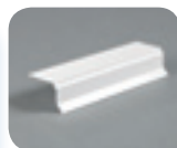
Sheet End Trim