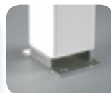
Canopy Post/ Foot